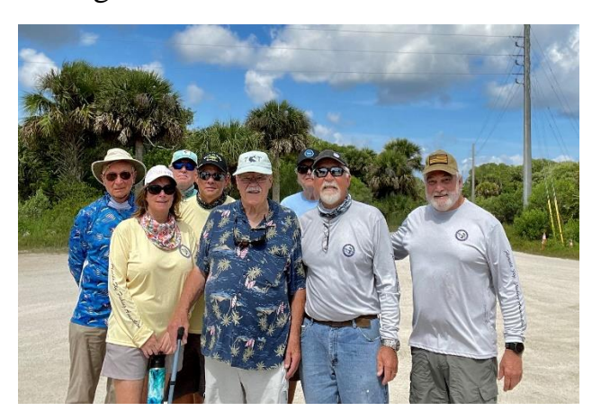
FFFA members ready for a trip to Dixie Crossroads after a clean up project at BioLab Road.

members gathered at the MIWR Tourist Center on May 25th and proceeded to BioLab Road to clean the first mile of the road from Highway 3 to the boat ramp and then South for another 3/4 mile. This activity took about 2-3 hours and collected several bags of trash. Afterwards, we all moved to Dixie Crossroads and enjoyed a fantastic lunch together. It was a wonderful morning helping the club give back to the community and enjoying each others company over lunch. The club will be performing this service activity quarterly, so if you missed this one make sure to see Don Foor to sign up for the next one in August.