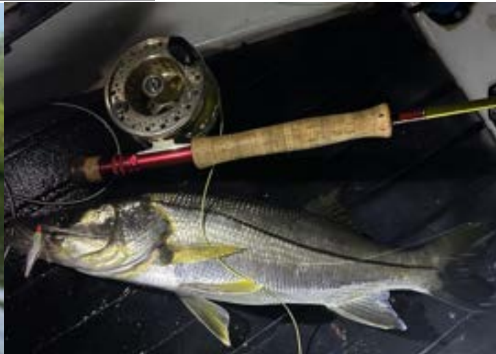
FFFA OUTING ON SEPTEMBER 12 TH WABASSO FLY FISHING OUTING